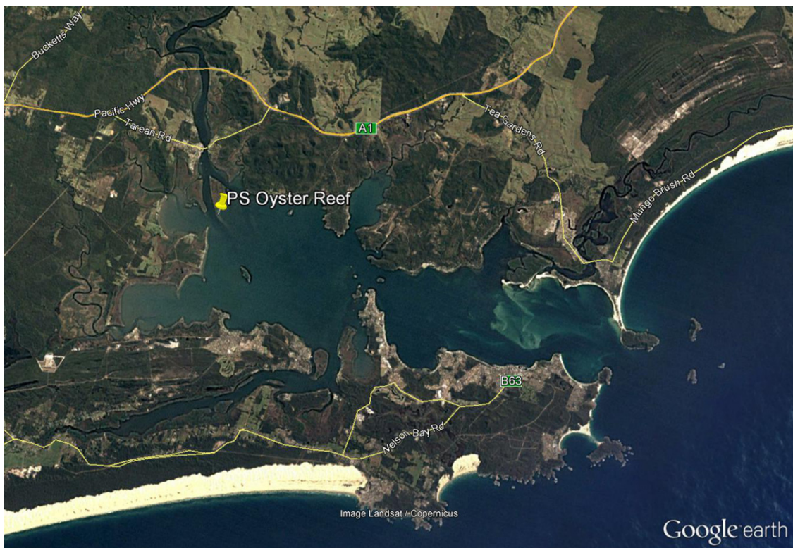
Figure 2. Location (yellow pin) of proposed oyster reef restoration site in Port Stephens.

Recently, a site in western Port Stephens has been identified (Figure 2) that provides a unique opportunity to support large scale oyster reef restoration in NSW with considerable environmental and community benefits and partnership opportunities. The site, near the mouth of Karuah River, meets a number of key ecological and management conditions and has demonstrated natural recruitment that is limited only by a lack of suitable substrate. The site is an old oyster lease site located away from the main boating channel (Figure 3). It is proposed to use clean waste oyster shell from aquaculture businesses in Port Stephens to provide additional substrate at the site for natural oyster recruitment and reef development.