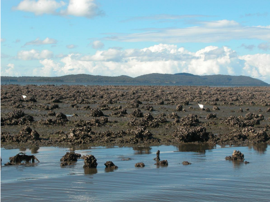
Figure 3. Current view of proposed oyster reef restoration site in Port Stephens at low tide.

Consultation with local oyster farmers, Port Stephens-Great Lakes Marine Park management, aquaculture and biosecurity staff within the Department of Primary Industries, have provided preliminary support for the proposal. Introductory consultation with oyster farmers in Port Stephens has shown they are interested in the opportunities to supply the required oyster shell, currently a waste product for their businesses, and to participate in the logistics of delivery and construction activities.